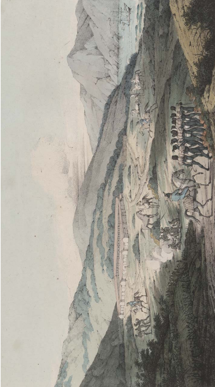
FIGURE 3. In the foreground, a mounted overseer carrying a whip or lance marches ten California Indians north toward San Francisco Bay. To the left, another overseer on horseback drives three California Indians south. Louis Choris, “Vue du Presidio s. n Francisco [View of San Francisco Presidio],” lithograph, c. 1815.