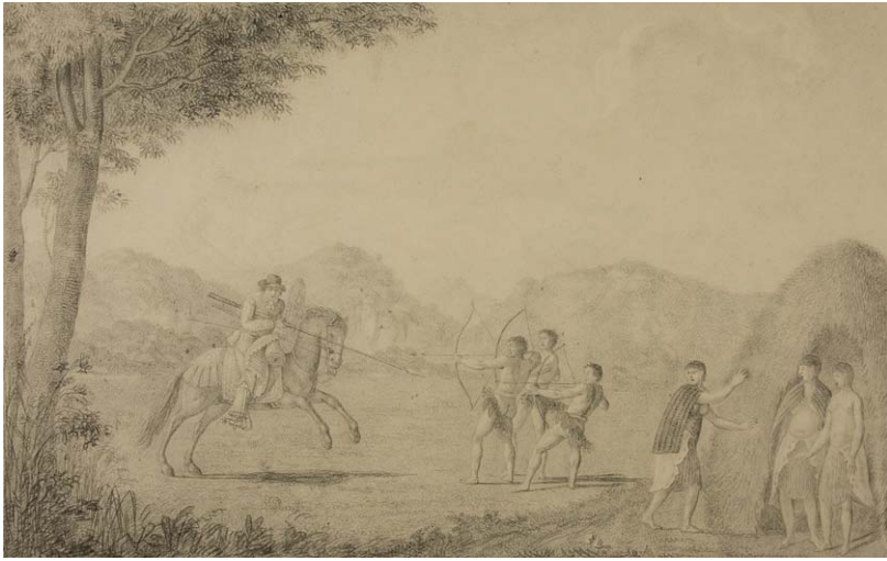
FIGURE 4. This drawing illustrates how Rumsen or Costanoan archers would defend their community from a charging Spanish dragoon. Tomás de Suria, “Modo de pelear de los Yndios de Californias [Mode of combat of the Indians of the Californias],” pencil drawing, 1791.

In response to the rising number of escapees, the state supported increasingly violent recapture operations. In 1797, Spanish soldiers attacked a group of escapees and non-mission Indians, killing seven and capturing eighty-three. 120 Three years later, Sergeant Pedro Amador killed a chief during a recapture and round-up operation. 121 In 1804, Father Estevan Tapís reported, “fugitives are increasing and the only remedy is an immediate increase of military force.” 122 Others listened. In 1812, an expedition from missions San Francisco and San José attacked escapees and their allies, leaving “many dead.” 123 In 1829, the Mexican soldier Joaquín Piña recorded how his unit attacked escaped California mission Indians, killing perhaps thirty or more people, including male and female prisoners. 124 The following year, a Mission San Rafael priest ordered some escapees recaptured, enlisting the