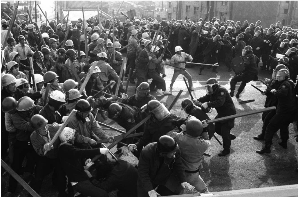
FIGURE 1: Sanpa Zengakuren members battle riot police on the Suzugamori Expressway ramp near Haneda Airport, October 8, 1967.