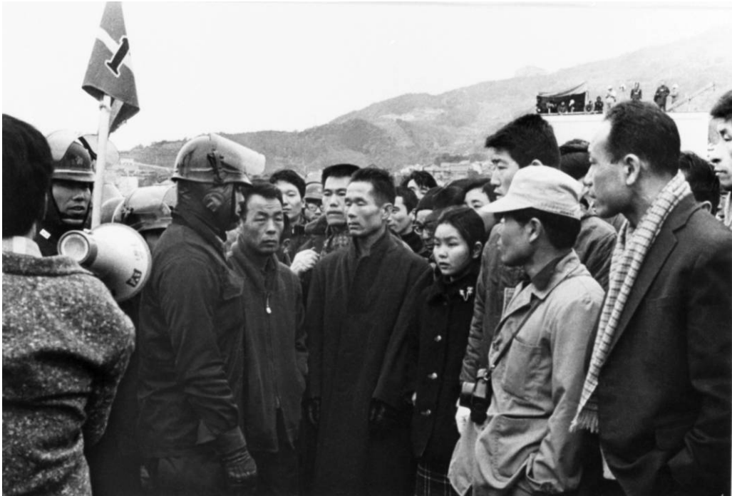
FIGURE 8: Citizens object to riot police tactics in Sasebo, January 21, 1968.

even grudging admiration. [Sanpa] students' fundraising campaign among townspeople reported surprisingly successful in collecting sympathy as well as money. 115