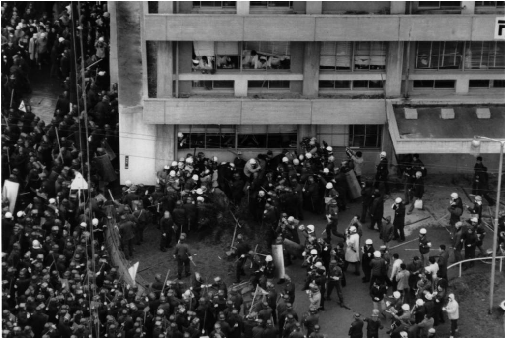
FIGURE 5: Students are hemmed in and assaulted by riot police outside the Sasebo Citizens' Hospital while staff watch from the windows, January 17, 1968.

a front-page photo of a police pincer attack overrunning the grounds of the hospital where the correspondent was beaten, the photographs sympathetically portray victims of police excess. (See Figure 5.) An image of an arrested student, his head bathed in blood, is featured above an image from the Sasebo Citizens' Hospital [Sasebo Shimin Byōin], where an activist student and a journalist sit side by side receiving care from the white-attired young nurses. (See Figure 6.) Other images show the massed protesters on Hirasebashi Bridge under fire from water cannon blasts, and a mass of perhaps nine riot police clubbing a downed student on the hospital grounds.