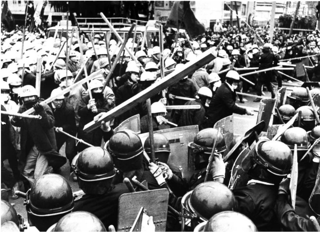
FIGURE 9: Students battle riot police in Sasebo, January 21, 1968.

protest to become effective. To put it crudely, “nonviolence” was enabled by violence, that is, by a violent display whose results revealed and delegitimated massive state violence, while reenergizing and broadening political possibilities.