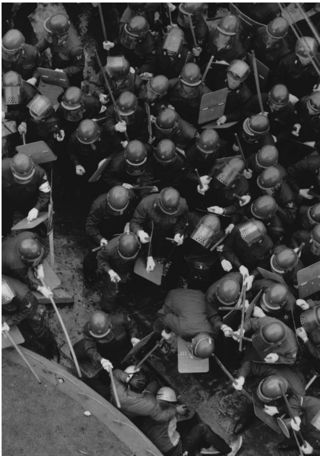
FIGURE 7: Massed riot police beat two fallen demonstrators in Sasebo, January 17, 1968.