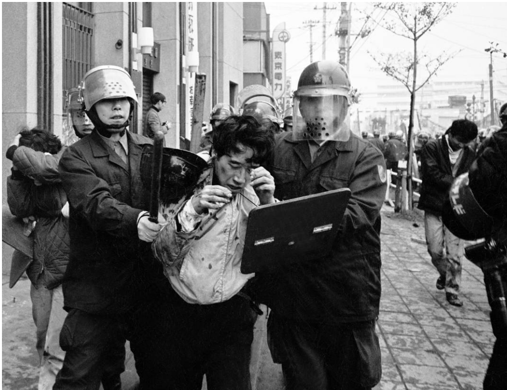
FIGURE 3: Police lead beaten, bleeding demonstrators away to waiting wagons, November 12, 1967 (Second Haneda Incident).

izen victims of the state continued with an article in Yomiuri on November 14 criticizing the chilly response to citizens' claims for damages inflicted by the police. 42