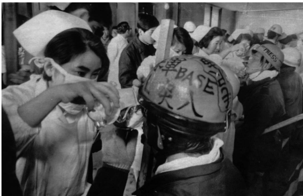
FIGURE 6: Nurses at the Sasebo Citizens' Hospital treat students and press afflicted by tear gas exposure, January 17, 1968.

while, the tear gas infiltrates the hospital, and numerous members of the staff and patients soon require treatment—the first point at which “ordinary citizens” become victims of the police action. 94