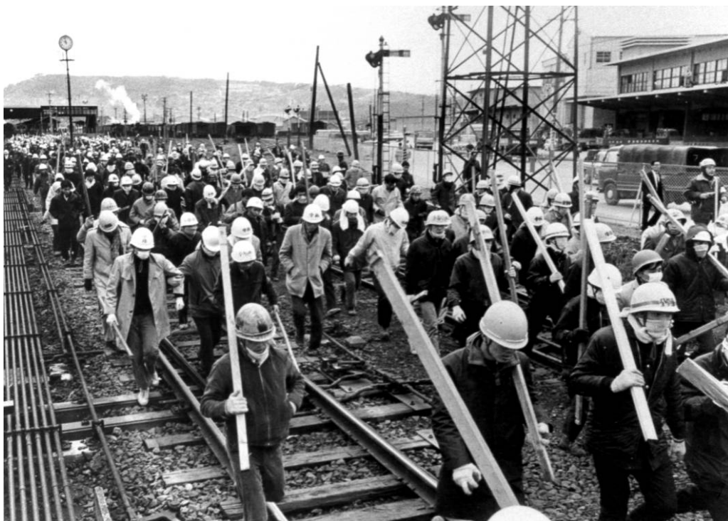
FIGURE 10: Sanpa students—many carrying geba-bō timber staves—march along the railway tracks on their way to Hirasebashi Bridge, January 17, 1968.

erations, along with border incursions and an alleged assassination plot against South Korean president Park Chung-hee, for a moment made the sudden advent of a second Korean War conceivable, one that would immediately involve Japan directly. 133 Although this disaster never materialized, the events surrounding the seizure of the Pueblo demonstrated the degree to which Japan's security commitments and arrangements could bring about sudden participation in American wars, current and future. The ingredients were all there: the Pueblo had sailed from Sasebo in early January, as of course had the Enterprise , itself diverted en route to its Vietnam station to command the task force responding to the Pueblo situation. 134 Of the planes dispatched to the Western Pacific in response, Kadena Air Force Base on Okinawa received fifteen B-52s. Beginning February 15, these Kadena-based B-52s commenced regular bombing runs of North Vietnam, averaging 350 sorties per month. 135