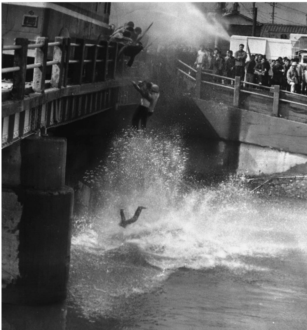
FIGURE 2: Students are blasted by police fire hoses off of Bentenbashi Bridge into the river, October 8, 1967.

In a flurry of editorials and articles, newspapers roundly condemned the violent tactics of the students, with some quoting Chief Cabinet Secretary Kimura Toshio's statement that Yamazaki's death was the result of student groups' rehearsal for violent revolution. 21 The lead editorial in the daily Asahi Shinbun on October 9 accused them of attempting to deliver a "revolutionary" appeal through violent shock tactics, and thus "taking advantage of society's beneficence toward students and abusing the right of free expression" in their attempt to gather attention. A sensational two-page illustrated spread proclaimed a "Deadly Clash, Outrageous Conflagration," declaring that the violent action was premeditated (following a September 26 national appeal by Sanpa), and that female students had gathered stones