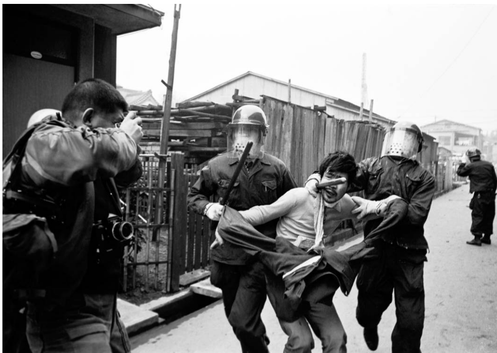
FIGURE 11: Photographers capture rough arrest of demonstrator by riot police near Haneda Airport, November 12, 1967 (Second Haneda Incident).

The events in Shinjuku established a new equilibrium between state violence and public opinion, restoring legitimacy to police suppression, and threatening to once again reduce activists' voices to mere noise. Morley's extensive analysis of the student movement in April 1969—an analysis that anticipated the approaching Security Treaty struggles of 1970—concluded that “repeated incidents of student violence, crescendoing to the riot at Shinjuku on October 21, have produced the backlash the police had hoped for. ” 139 New confidence by police and courts in public support against “protester violence” enabled escalated measures, including mass arrests, extended pretrial detentions, searches—even on university campuses without the acquiescence of their presidents—and finally, full-scale assaults against barricaded campuses. 140 Without another transformation of public perception, the decision by